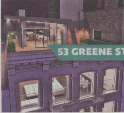
53 GREENE ST.

AORE was the lucky developer who nabbed 53 Greene, a six-story conversion originally built in 1867 as a storage house. Launching sales this week, the condo consists of four full-floor two-bedroom, three-bathroom units, each 2,771 square feet, which start at $6.34 million, and a 3,510-square-foot three-bedroom, four-bathroom duplex penthouse (with private outdoor roof space) for $14.05 million. While AORE didn't skimp on the top-of-the-line tech touches, N-Plus Architecture and RSVP Architecture Studio did yeoman's work restoring the building's facade with Tuckahoe marble, as well as the columns and cornices that makes one fall in love with SoHo. Closings should begin this spring. Contact: Shlomi Reuveni, Brown Harris Stevens SELECT, 212-396-5801