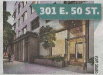
301 E. 50 ST.

Nestled near the UN is a building the French delegation will probably show some interest in. The 29-story, 57-unit condo from CBSK Ironside was inspired by French modernism and has a limestone facade; the interiors and exteriors of the one- to four-bedrooms (with two penthouses) were designed by COOKFOX, whose previous work has graced 150 Charles and One Bryant Park. Units will range from $1.5 to over $10 million. Amenities include a fitness center with cedar sauna and tea lounge. Did we mention it's shooting for LEED Gold certification? Joan Switfit and Betrand Buchin will be leading sales this spring and delivery is expected at the end of 2015. Contact: Douglas Elliman Development Marketing, 212-838-5050