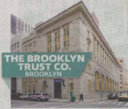
THE BROOKLYN TRUST CO. BROOKLYN