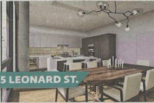
15 LEONARD ST.