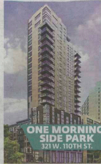
Williams New York

In the last few years, developers realized something important: the classics are good. Classics like the Upper East Side. Classics like a brick exterior with a two-story limestone base. Like 151 E. 78th St., architect Peter Pennoyer's first condo, a 16-story building with 14 residences ranging from three- to six-bedrooms measuring 3,300 to 7,000 square feet. Included in the admission — units start at $10 million and go up to $30 million — is a 24-hour doorman, landscaped garden, resident library, fitness studio, bike room and live-in resident manager. Sales begin this month; move-ins are expected in December 2015. Contact: Alexa Lambert and Cathy Taub, Stribling, 212-452-4408 and 212-452-4387