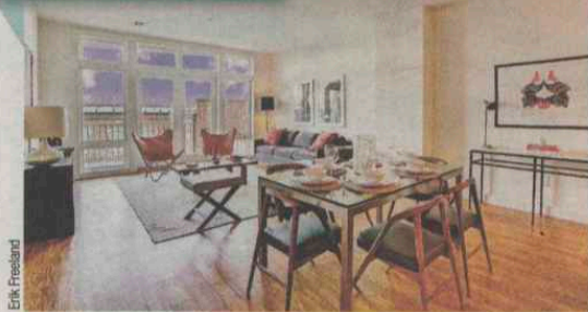
THE ACCOLADE STATEN ISLAND

The fitness center at this Upper West Side condo boasts "natural light from a garden-level atrium," but you can get your fill of nature mere steps away, in Riverside Park. Each of the 14 residences — 12 full-floor units, one duplex penthouse, one triplex maisonette — are accessed by private keyed elevator and all have outdoor space. Traditional touches include barrel-vaulted ceilings in the entryway and hand-crafted plaster crown moldings in the living room. But make no mistake, these condos are thoroughly modern: ventless fireplaces, European showers with infinity drains and a state-of-the-art home automation system. Prices range from $2.728 to $8.5 million. Sales launched last week, move-ins are expected in spring. Contact: John Carapella, Cord Stahl, 646-532-4958