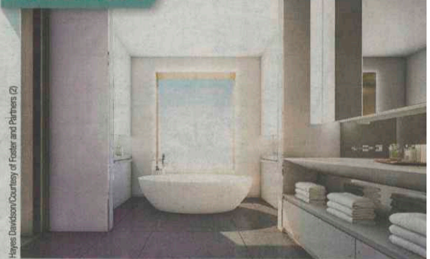
551 W. 21 ST.