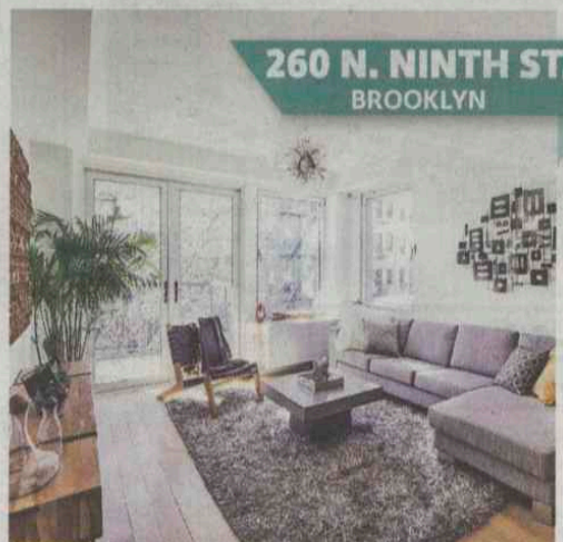
Williams New York